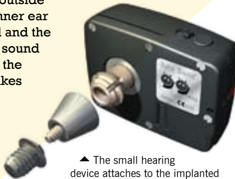
▲ The small hearing device attaches to the implanted screw and fits behind the patient’s ear.